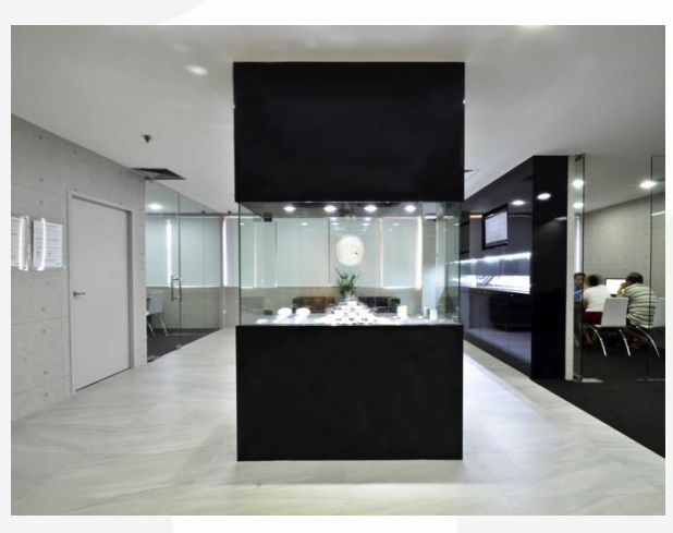
Silver Bullion's retail office at Certis Ciso Centre

Silver Bullion Pte Ltd, having more than 330 Million SGD in total revenue, is now ranked 33<sup>rd</sup> among Singapore's E50, which includes the most enterprising privately held firms in the city-state according to KPMG and The Business Times .