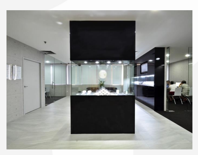
Silver Bullion's retail office at Certis Ciso Centre

Silver Bullion Pte Ltd, having more than 350 Million SGD in total revenue, is now ranked 33<sup>rd</sup> among Singapore's E50, which includes the most enterprising privately held firms in the city-state according to KPMG and The Business Times .