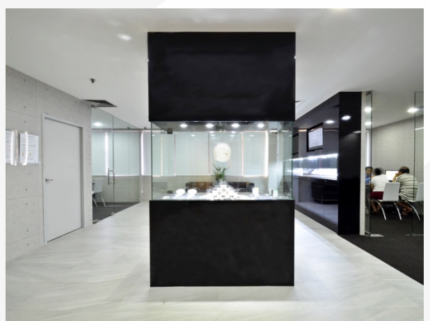
Silver Bullion's retail office in Singapore

Silver Bullion Pte Ltd, having more than 400 Million SGD in total revenue, was ranked 33<sup>rd</sup> among Singapore's E50, which includes the most enterprising privately held firms in the citystate according to KPMG and The Business Times .